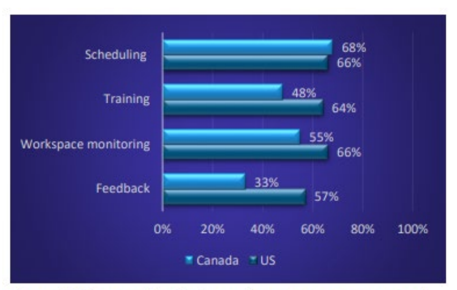
Figure 2: % reporting their employer uses management automating AI — Scheduling [US (N=992) and Canada (N=136)]; Training [US (N=922) and Canada (N=129)]; Workspace monitoring [US (N=804) and Canada (N=120)]; Feedback [US (N=927) and Canada (N=129)]

Virginia Doellgast, et al, Al in contact centers Artificial intelligence and algorithmic management in frontline service workplaces (2023) <a href="https://ecommons.cornell.edu/items/2c04c957-d672-400e-9aed-adb5f6ace640">https://ecommons.cornell.edu/items/2c04c957-d672-400e-9aed-adb5f6ace640</a>